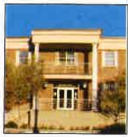
HIGHLAND COUNTY 1975 ADMINISTRATION BUILDING 1975